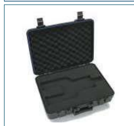
Optional Hard Case Model 7044